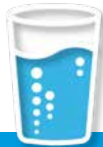
Sparkling & Flavoured Water

Sparkling water with or without flavour to upgrade hydration choices for city officials.