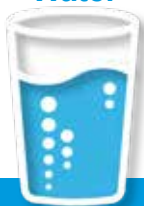
Sparkling & Flavoured Water

Sparkling water with or without added flavour to allow clients to fully relax.